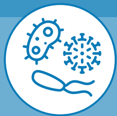
bacteria, viruses, & fungi